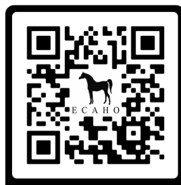
Rules for Conduct of Shows