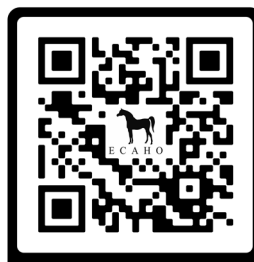
Rules for Sportclasses